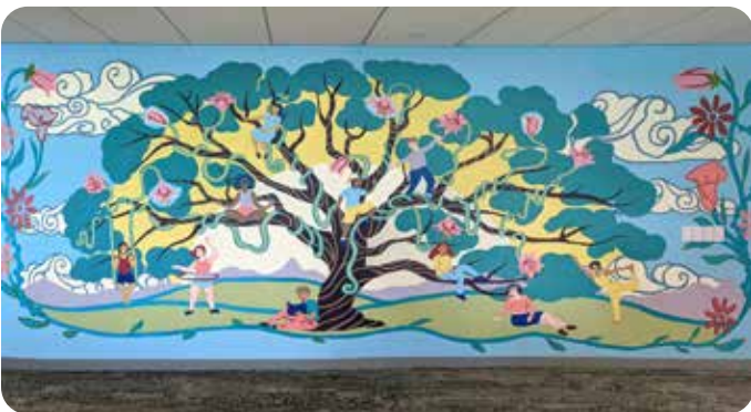
ABOVE: Brighter Lives, Better World: Mural on the wall at Signify, created by RVCC Arts & Design students

#bestofnewjersey #signify #rvccproud #raritanvalleycommunitycollege #rvccfacultyrock #rvccarts&design #rvccstudents