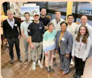
Left: Members of the RVCC Women's Volleyball Team Right: Some RVCCProud alumni!!